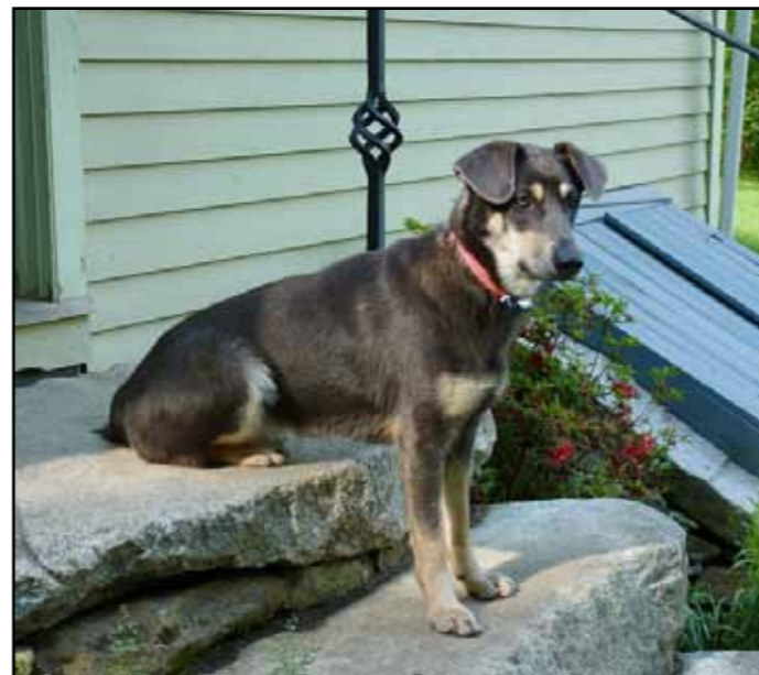
Moonsong Small Wonder (Reine)