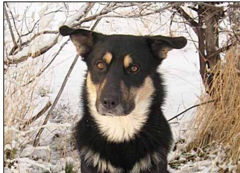
Cloudburst Ledgebak Eclipse (Tiber)