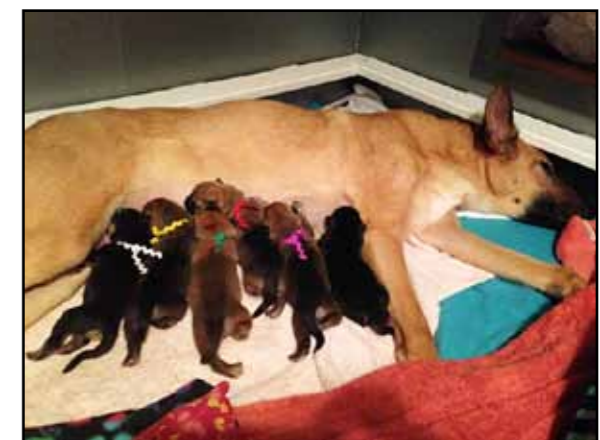
GreatMountain - Franconia Notch