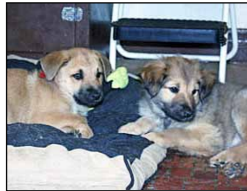
Rivertrail - The Furryners