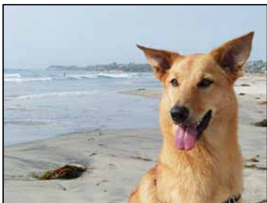
MountainThunder Great Kyraina (Kyra)