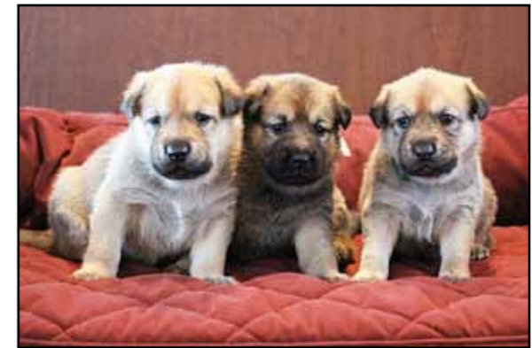
Bashaba - Lead Dog