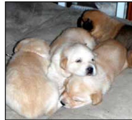
RainMountain - Cosmic