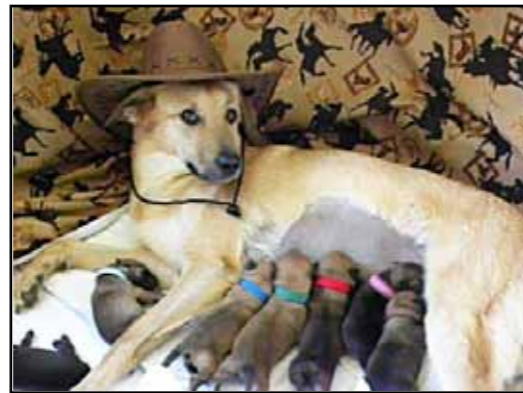
MountainThunder - The Wanted