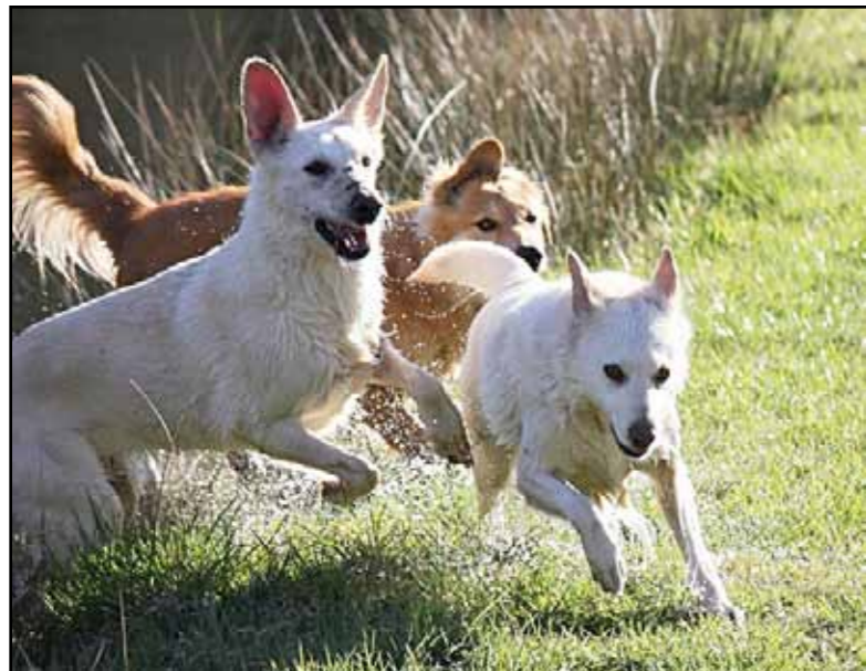
Willow, Sky, & Calli