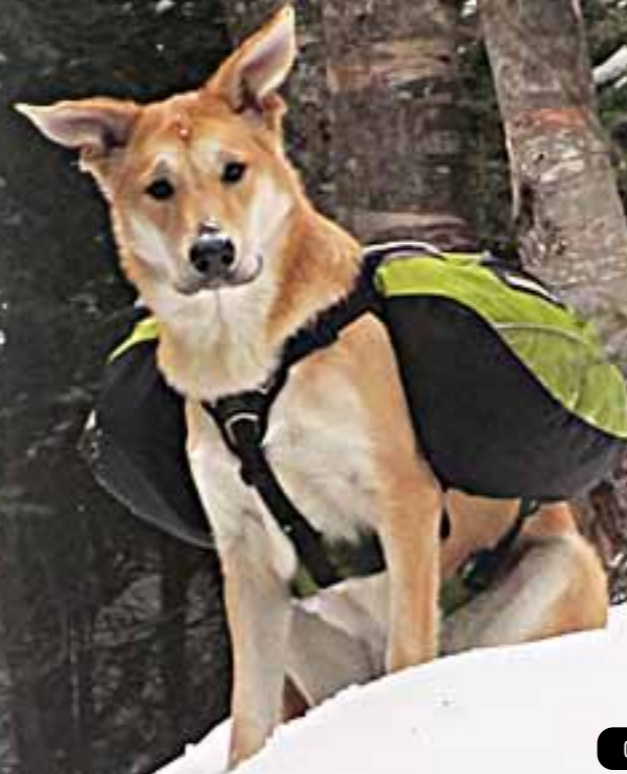
Granite Hill Ooli