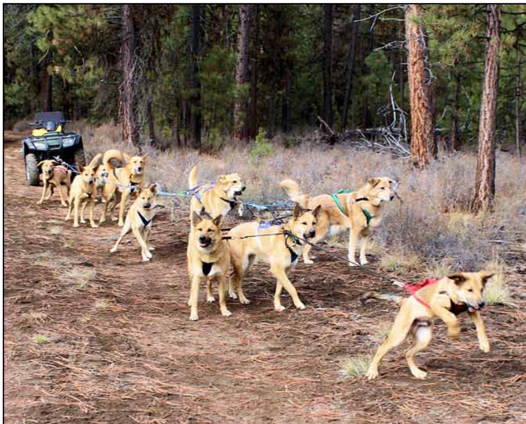
BrownStone Cascade Mt. Trask in the lead