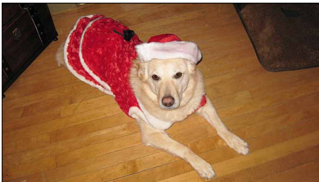
Happy holidays from Hurricane Nittany!

*A Chinook receives certification from the Canine Health Information Center (CHIC) if it has obtained both hip and eye health tests, and one additional test - cardiac, elbow, or knee.