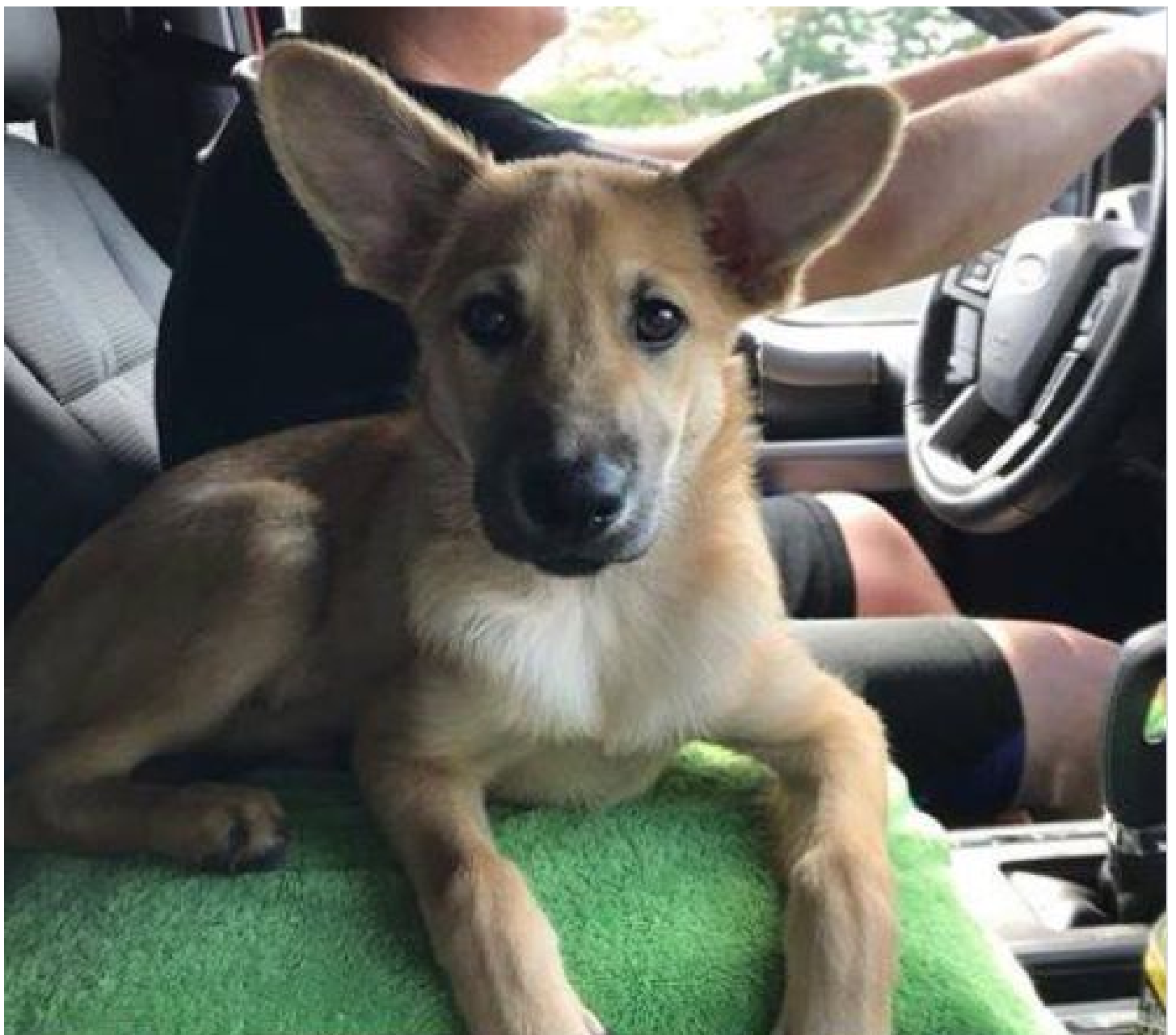
Summer Breeze Litter - Blue Sky Chinooks