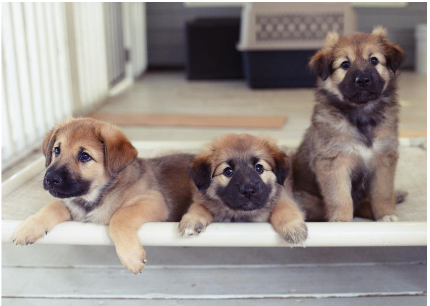
Bashaba Sweet Sawyer, Bashaba Some Kind of Blue & Bashaba Arya Nymeria by Jennita Reefhuis (Kucik)