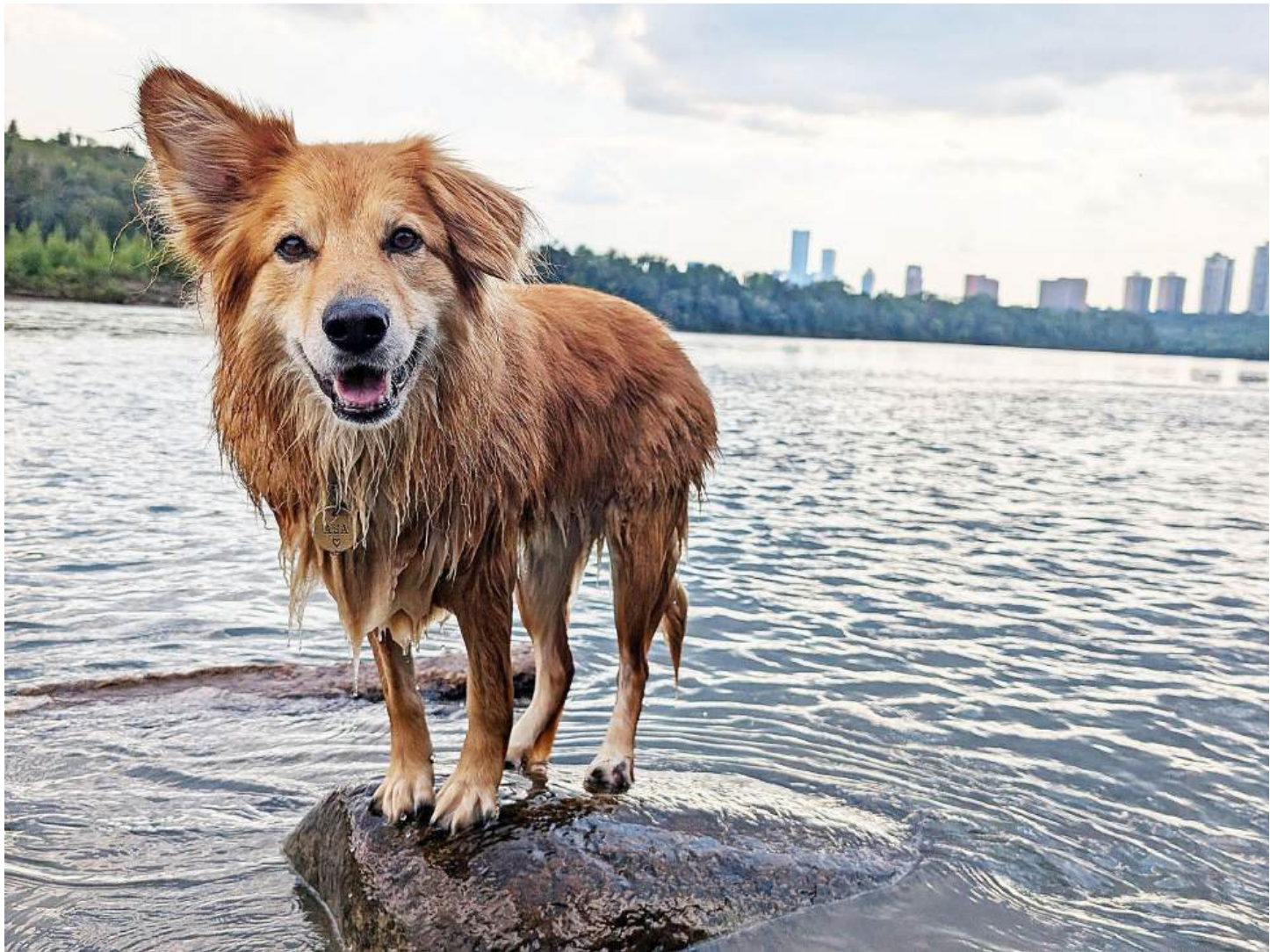
Swiftrun Jura Rain (Asa) by Taylor Scanlon

Welcome to the latest edition of the CQ! This issue includes something for everyone from a deep dive into the Use of Shipped Semen for Breeding to important reminders about the 2026 Photo Calendar Contest and needed gift basket donations for our upcoming Specialty in December. We're also excited to feature the writing and drawing skills from a couple of our talented junior members!